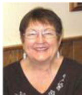
By Shirley Humnitsch